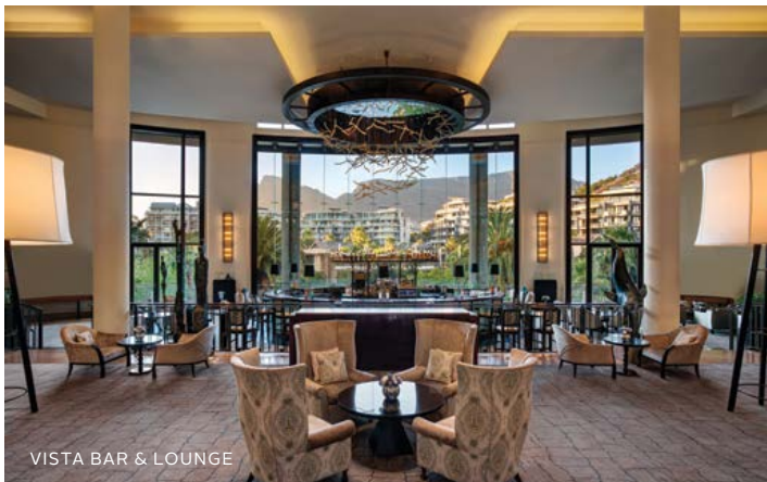
VISTA BAR & LOUNGE