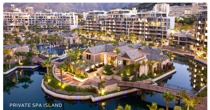
PRIVATE SPA ISLAND