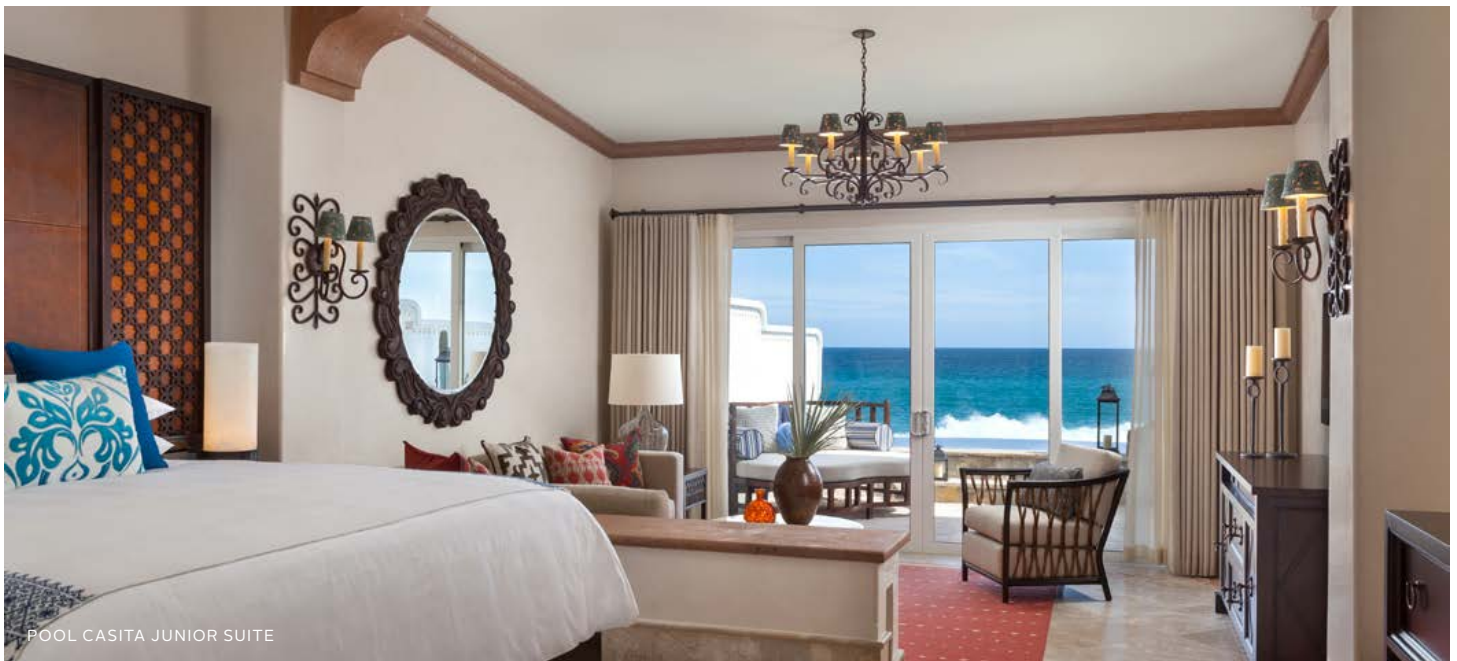
POOL CASITA JUNIOR SUITE