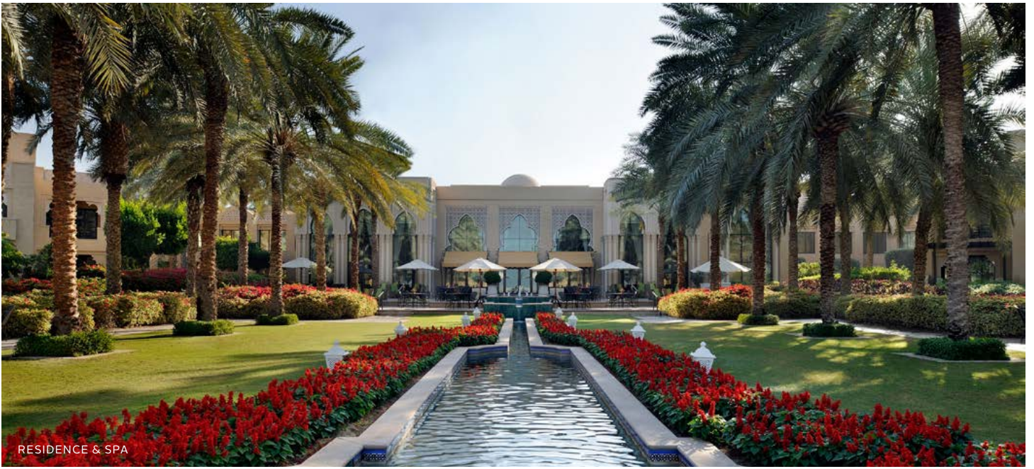
RESIDENCE & SPA