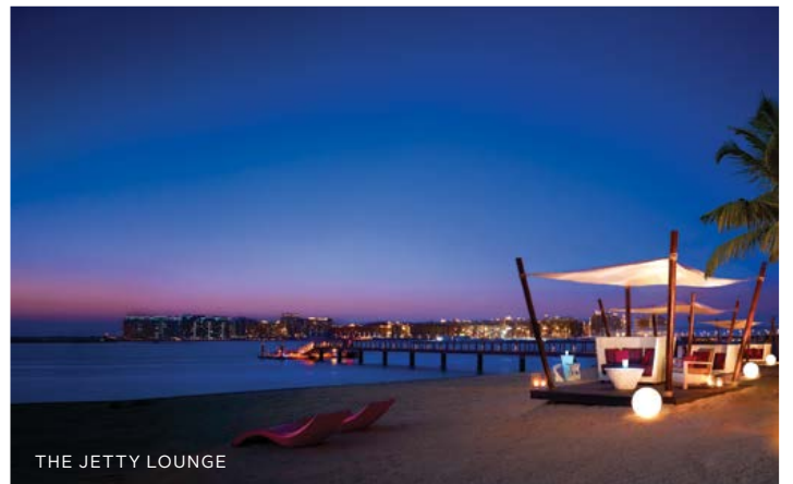
THE JETTY LOUNGE