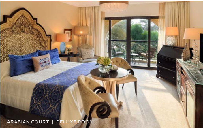
ARABIAN COURT | DELUXE ROOM

Exquisitely detailed, located on the fourth (top) floor, the magnificent Prince Suites offer an impressive outdoor terrace with 'Majlis' style seating, large dining table and sun-loungers. Luxurious bathrooms are spacious and adorned with wood, marble and slate.