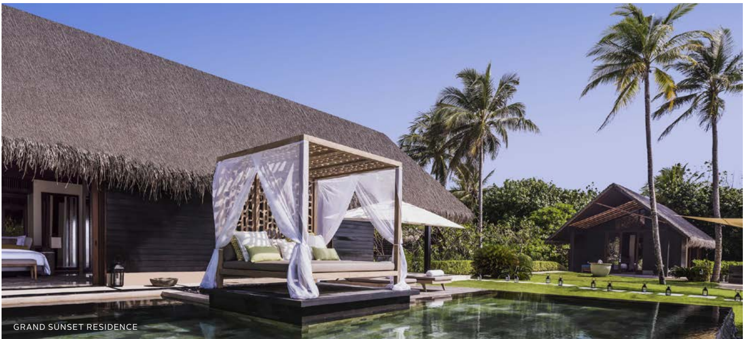
GRAND SUNSET RESIDENCE