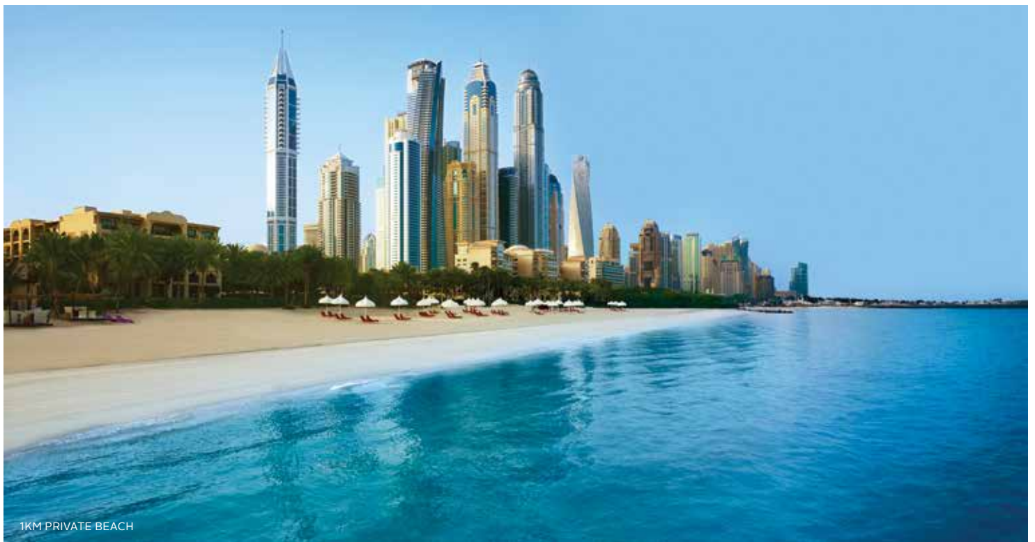
1KM PRIVATE BEACH