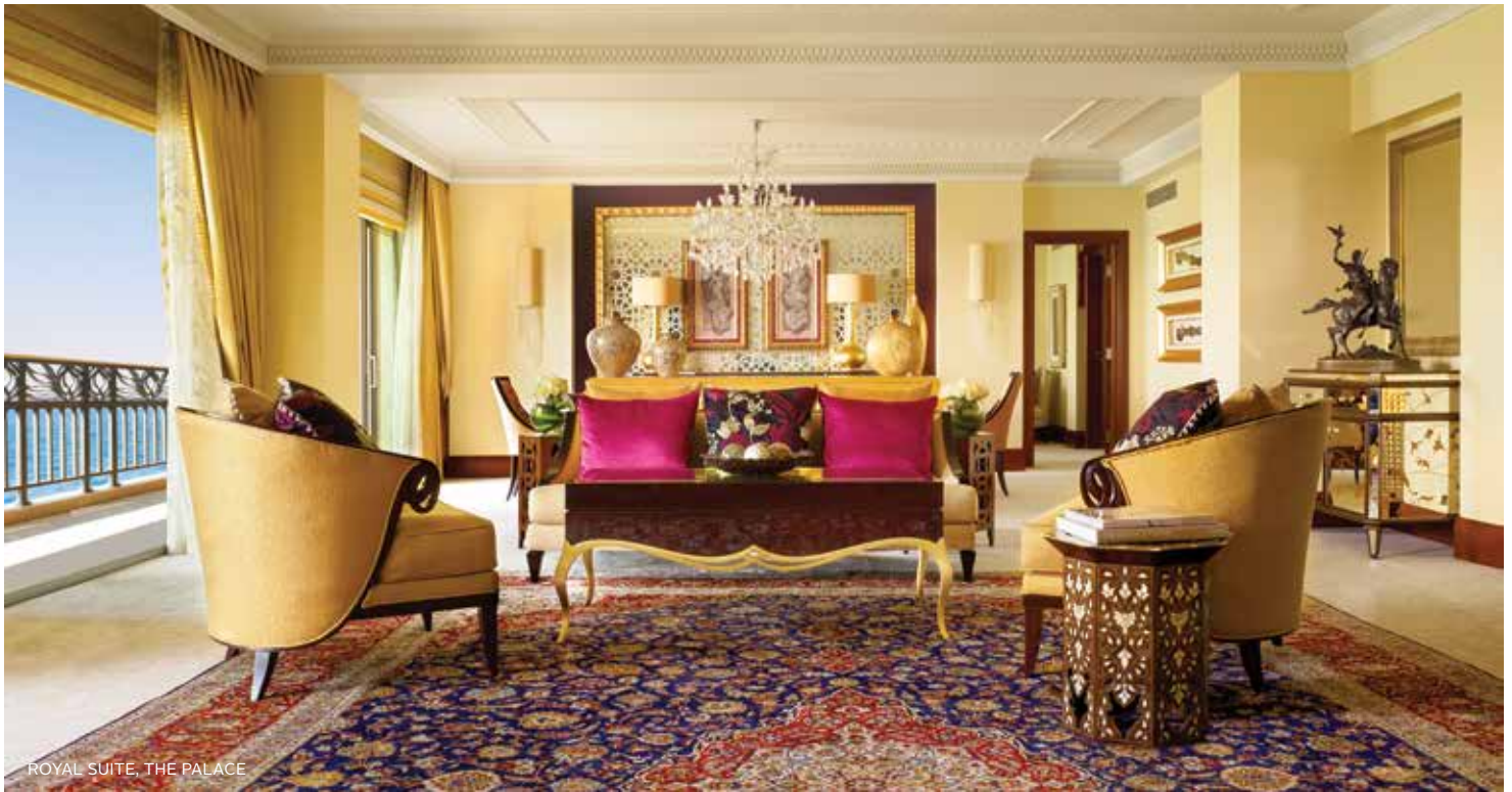
ROYAL SUITE, THE PALACE