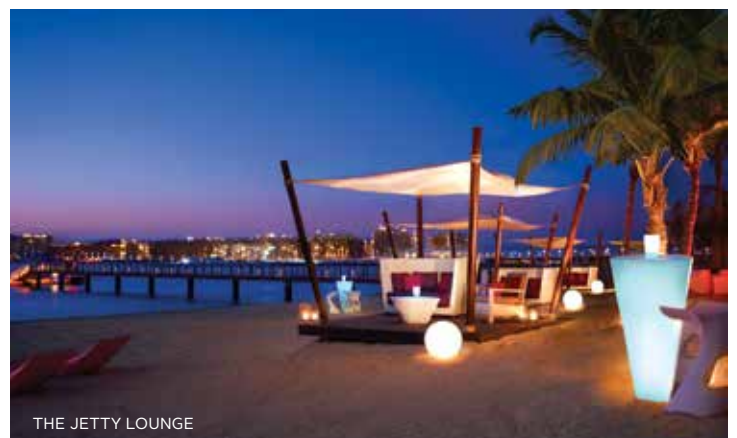
THE JETTY LOUNGE