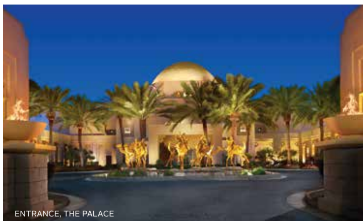
ENTRANCE, THE PALACE