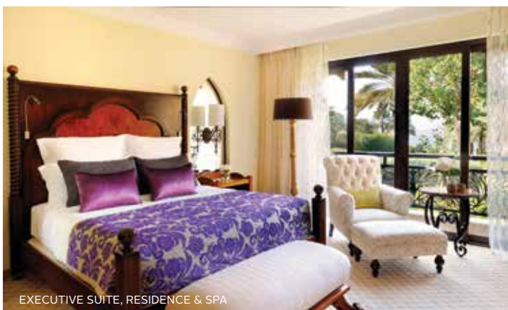
EXECUTIVE SUITE, RESIDENCE & SPA