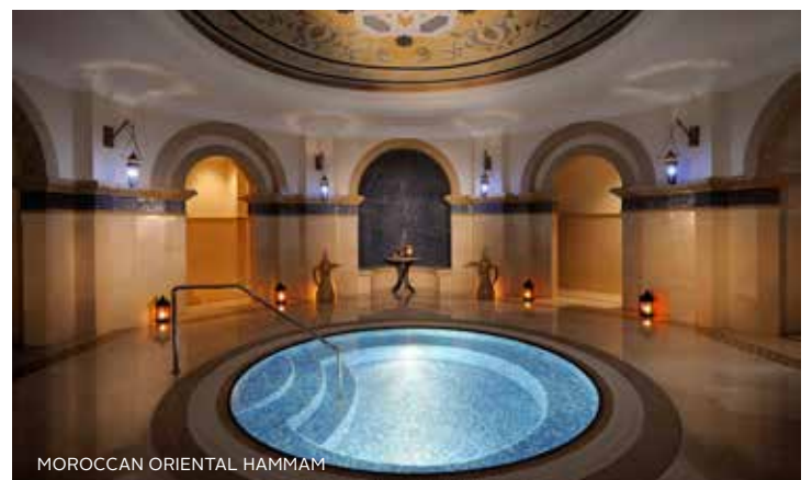
MOROCCAN ORIENTAL HAMMAM